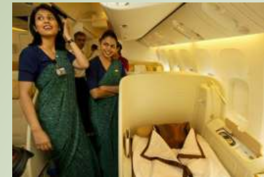
2. Tourism and hospitality including - Guides