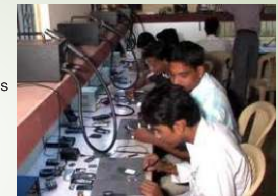
3. Repair of Domestic appliances and mobile phones