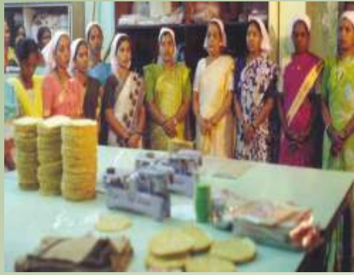
7. Food processing.