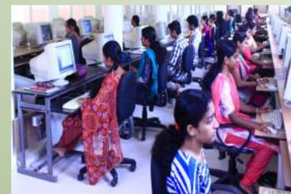
6. Office - services like DTP, computer operators, stenographer