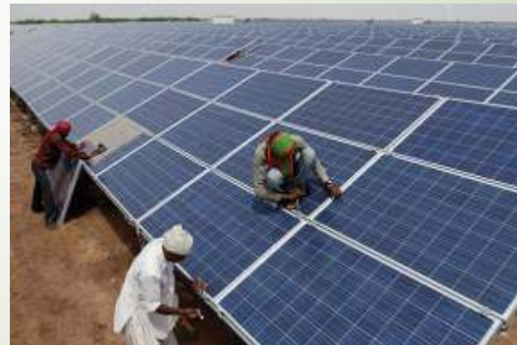
10. Solar power installation & maintenance.