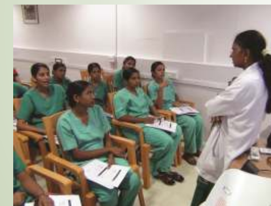
4. Nursing and Healthcare